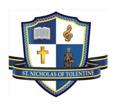
St. Nicholas Catholic School will purchase text to speech assistive technology tools to support students' reading skills with a TEAM Belong grant.

St. Nicholas of Tolentine School is an All Are Welcome School, offering inclusive Catholic Education to four hundred students of all backgrounds, races and educational learning needs. The school provides screenings, evaluations and speech, occupational and physical therapy to students. A team of educators including the principal, director of inclusion, behavioral therapist, counselor, Title 1 Teacher, and a classroom teacher meet weekly to discuss ways to support students and teachers to meet the educational needs of the growing, diverse population. In addition, the director of inclusion consults with classroom teachers and