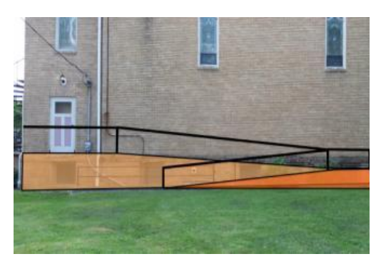
First United Methodist Church will use their TEAM Belong Award grant to construct an exterior ramp to the second floor sanctuary for safe exit in case of an emergency.

Over the past ten years, the congregation of First United Methodist Church, Lodi, Ohio, has worked intentionally to improve the accessibility of the church building. Accessible parking spaces, a curb cut, accessible washrooms and an elevator have been installed.